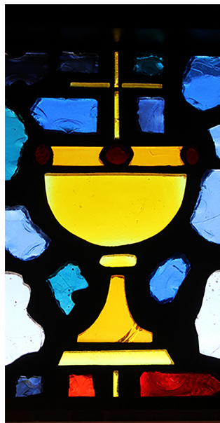
The chalice symbolizes holy Communion and the blood Jesus shed on the cross. Thus it connotes suffering, redemption and holiness (see especially Mt 20:22-23 and 26:27) – fitting for the name of the Calix Society.